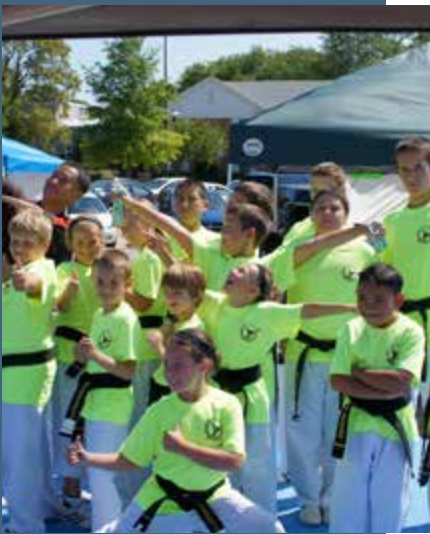
Morton Grove Farmers' Market