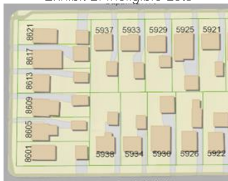
Exhibit 2: Ineligible Lots

(Addresses 8621 and 8601 would NOT be eligible for limited “by-right” street side yard fence under this amendment)