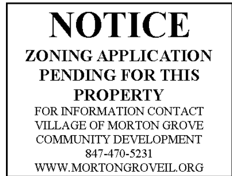
Sample Public Notice Sign

The Applicant should also expect Village Staff and Zoning Board members to visit the property to gather more information about the request. (Applicants may discuss the case with Village Staff, but should NOT speak about the case with Zoning Board members before the hearing; any violation of this can result in the case being withdrawn due to “ex parte” communications as specified by Illinois State Law. )