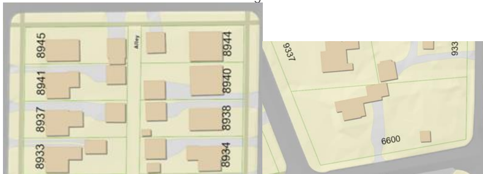
Exhibit 1: Eligible Lots

(Addresses 8945 and 894 would be eligible for limited “by-right” street side yard fence under this amendment)