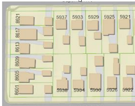
Exhibit 2: Ineligible Lots

(Addresses 8621 and 8601 would NOT be eligible for limited “by-right” street side yard fence under this amendment)