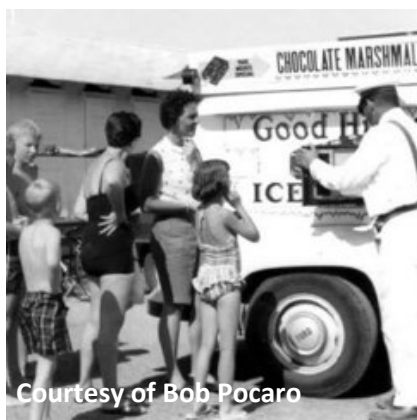
Getting ice cream at the Harrier Park pool from the Good Humor man circa 1960s