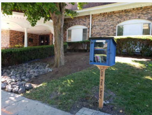
6101 Capulina Ave, Village Hall

Morton Grove's Community Relations Commission is proud to announce it has partnered with the Morton Grove Public Library and has installed a Little Free Library at the main entrance of Village Hall, 6101 Capulina Avenue. Little Free Libraries are a way to promote literacy and interaction with neighbors. The library box is stocked with free reading material for both children and adults. All are encouraged to come pick up a free book or leave a book in the box for others to enjoy.