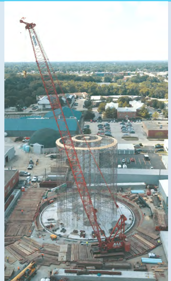
Construction of New 7 Million Gallon Standpipe 7900 Nagle

The project goal continues to be first year savings, every year saving, with savings going back into our infrastructure to control costs long-term.