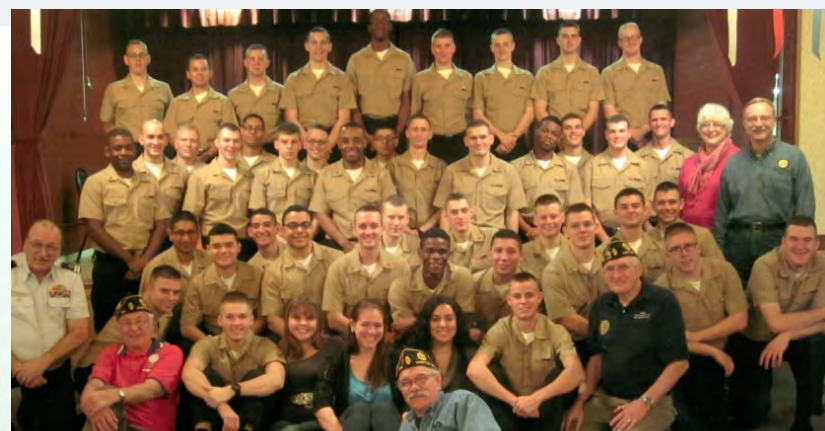
American Legion Post 134, 6144 Dempster St.

Monetary donations for this worthy cause can be mailed to: