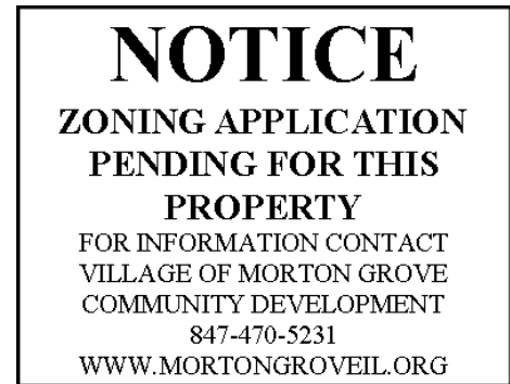
Sample Public Notice Sign

The Applicant should also expect Village Staff and Zoning Board members to visit the property to gather more information about the request. (Applicants may discuss the case with Village Staff, but should NOT speak about the case with Zoning Board members before the hearing; any violation of this can result in the case being withdrawn due to “ex parte” communications as specified by Illinois State Law. )