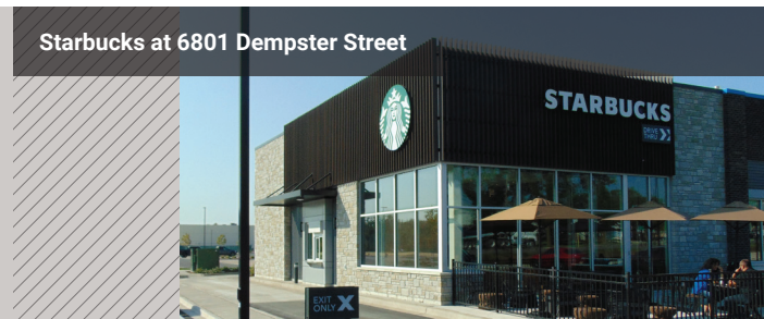
Starbucks at 6801 Dempster Street

Construction of the bike trail connection between the Forest Preserve District's North Branch Trail and Sawmill Station will coincide with completion of the residential development site improvements. The Village and developer continue to work closely with the Forest Preserve District of Cook County on the trail connection's design and construction.