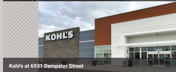
Kohl's at 6931 Dempster Street