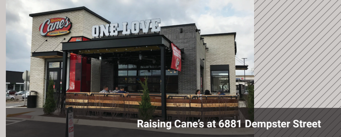
Raising Cane's at 6881 Dempster Street